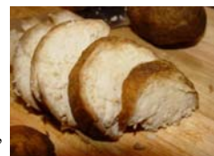
Story by Naashon Zalk

cies will most likely go unrewarded. Resembling small potatoes on the outside, once broken open they reveal a soft, whitish flesh with the texture of hard, slightly crumbly cheese.